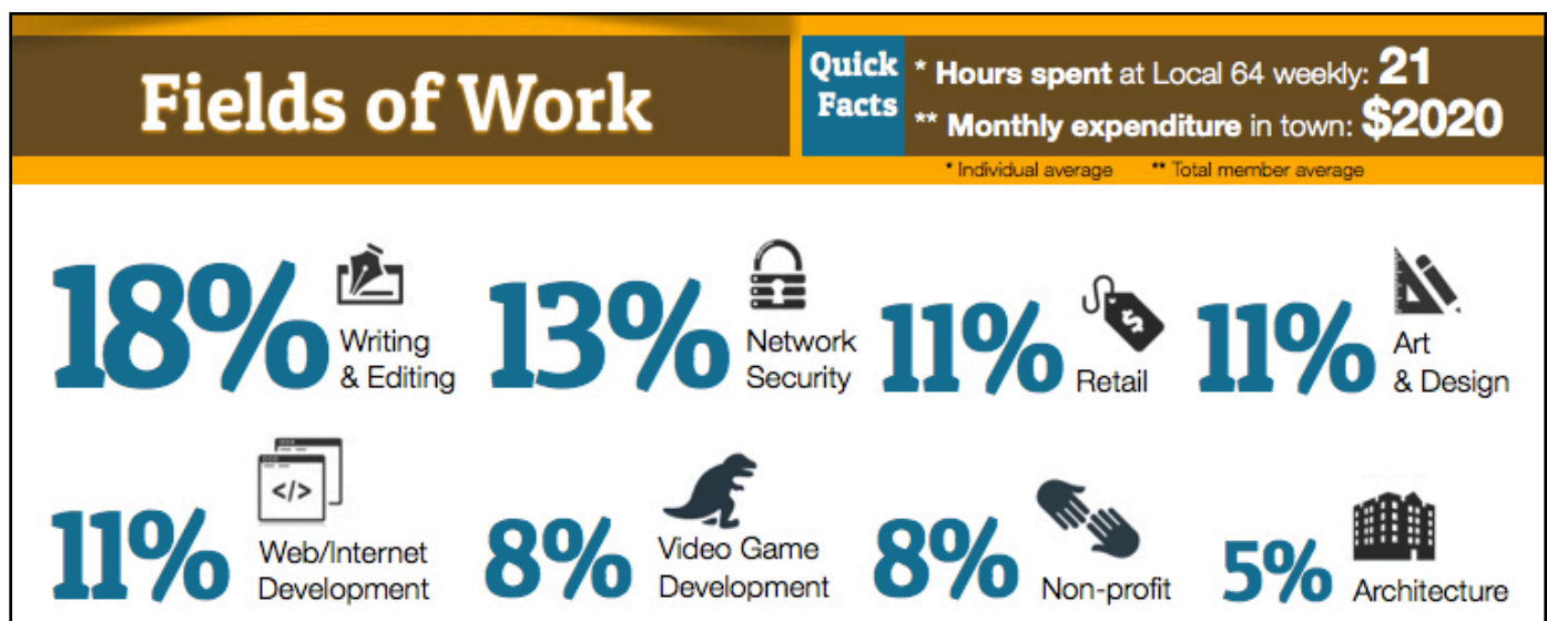
Illustration 2. Membership Fields of Work at Local 64

A final consideration are the goodies. One way we’ve been able to incentivize “leveling up” among memberships is adding a clear and entirely distinct value to members at the “Nomad” level and higher, which is a “Passport” relationship with Office Squared, a coworking space in Burlington. With the passport, which all members at the “Nomad” level and higher are entitled to after thirty days, any member can use Office Squared amenities at no cost. The same is true for Office Squared members: they can enjoy full, transferable membership to Local 64. While this opportunity has proven to be particularly valuable to a few members that have clients or parent offices in Burlington, it appears that mere awareness of this membership benefit is attractive.